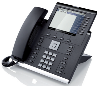
OpenScape Desk Phone IP 55G