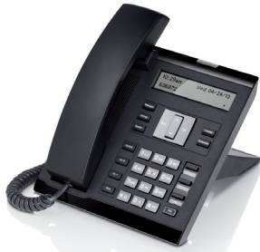
OpenScape Desk Phone IP 35G

Also, the new device types offer the well-known feature set to the customers!